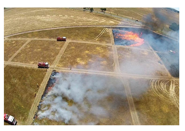
Figure 1. Aerial view of simultaneous paired experiments to examine the effect of different curing states on fire behaviour. The fire at top right is in fully cured grass whereas the fire in the foreground is in 60% cured grass.

Once senescence commences in individual plants, the overall condition of a sward becomes quite complex with a mix of living, dying, drying out and dried out fuels. Fire spread also becomes similarly complicated. Understanding just how a fire behaves in such fuel conditions is critical to predicting its behaviour, particularly under more potent burning conditions.